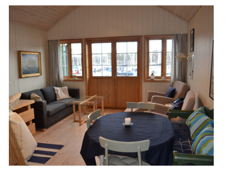
Inside some boat houses

No duvets available so you need to bring a sleeping bag.