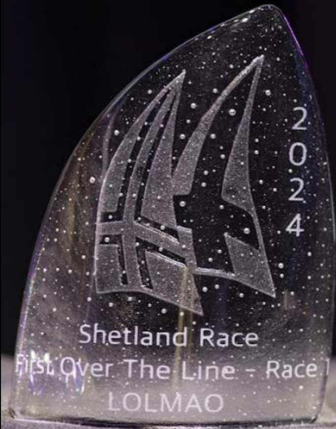
First over the line in Lerwick