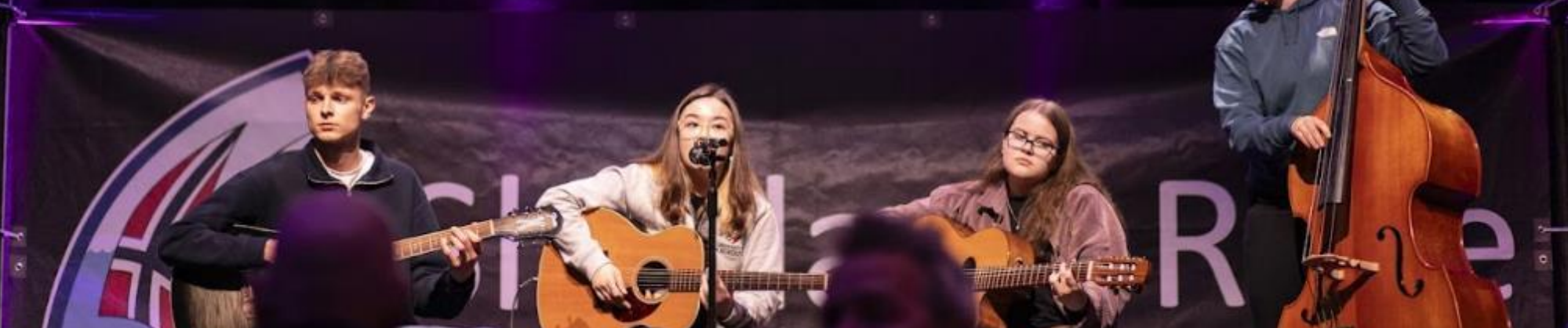
High Level Hot Club