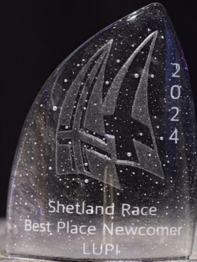
LOCAL TROPHIES Newcomer Prize