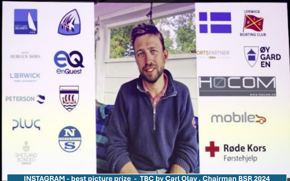
INSTAGRAM - best picture prize - TBC by Carl Olav , Chairman BSR 2024 (The unlucky dismasted skipper of Winocean)