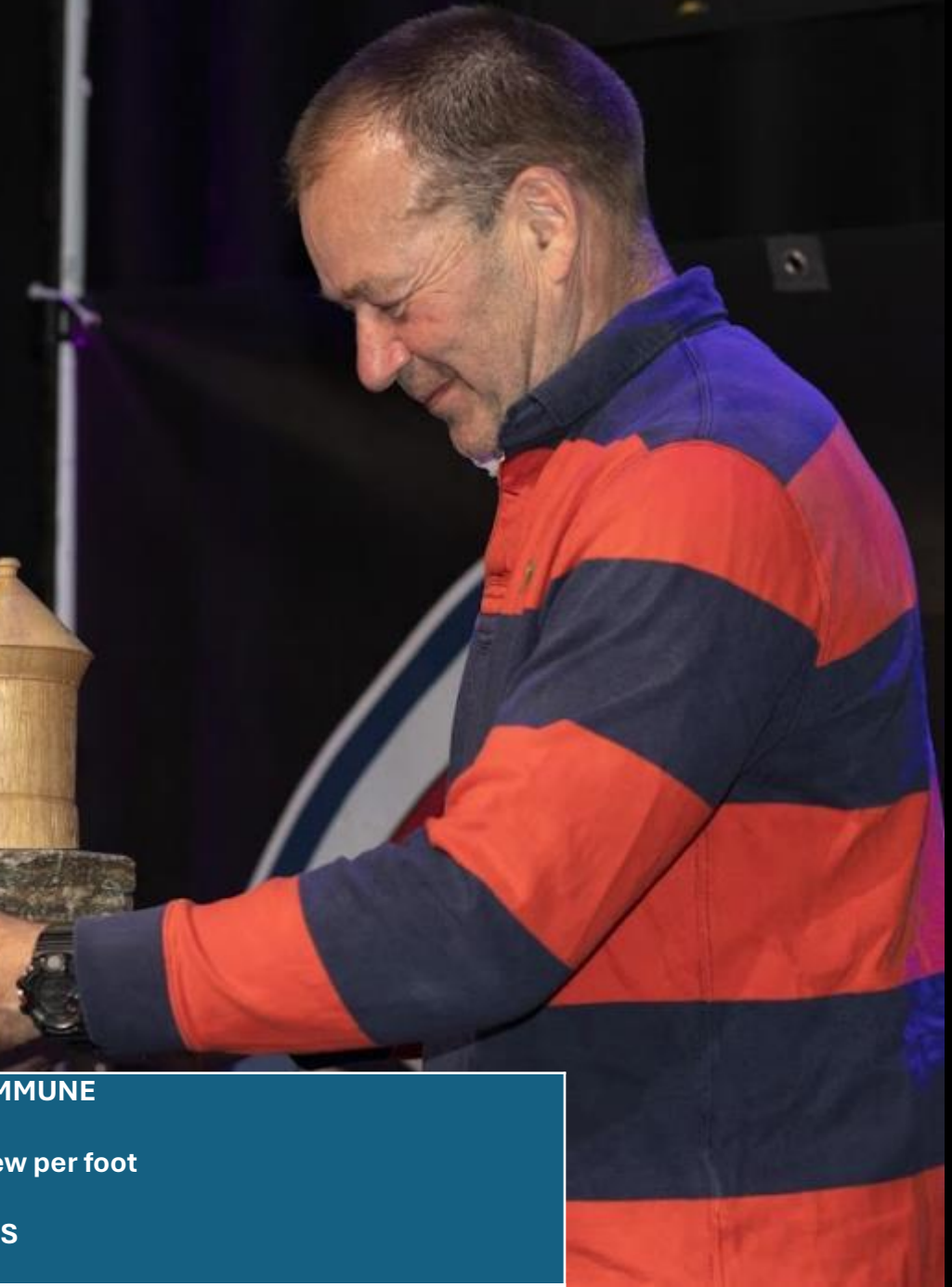
OYGARDEN KOMMUNE Trophy for most crew per foot AMARYLLIS