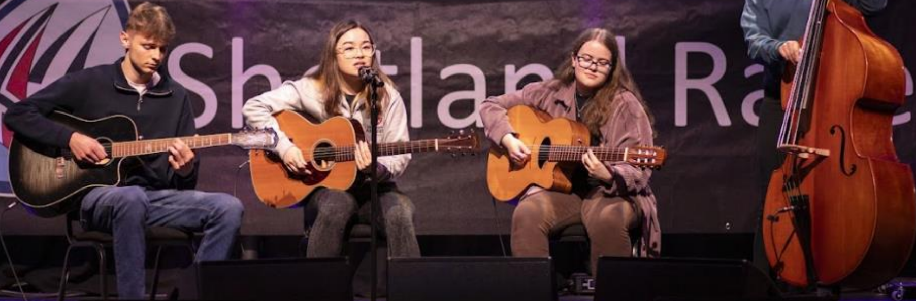
High Level Hot Club