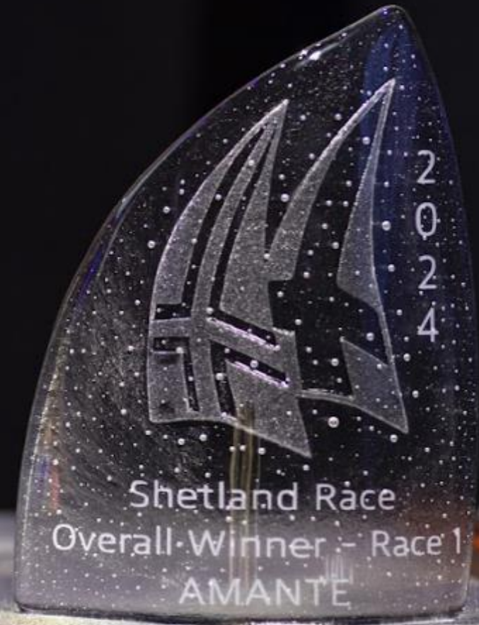
Winner Overall Bergen-Lerwick Race